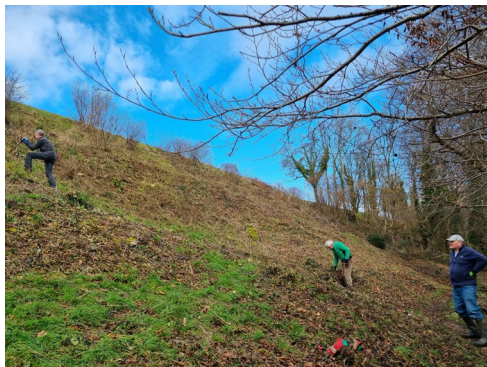
Above: A morning's work by 7 members.