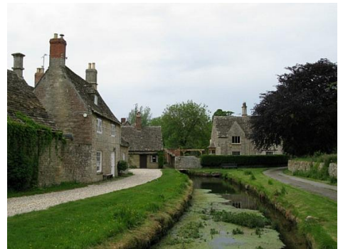
The River Thames in Ashton Keynes