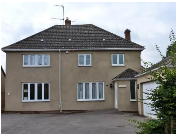
The Vicarage 14 Bath Road, Cricklade, Wiltshire SN6 6EY

The vicarage in Cricklade is a modern four bedroom house with three reception rooms, a study and a large kitchen and utility room. There is a large garden ideal for children. It has a double garage and plenty of parking space. It is a short walk from St. Sampson's church and from Cricklade High Street. It is also very convenient for St. Sampson's primary school. We are in the catchment area for four good secondary schools, three of which have been rated outstanding.