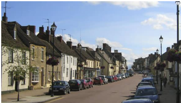
Cricklade High Street

We are a friendly group of four parishes that make up the Upper Thames Group (UTG) committed to living out our vision of "creating opportunities for everyone to experience God's love". The four parishes include a small town (Cricklade), and three villages (Ashton Keynes, Latton and Leigh).