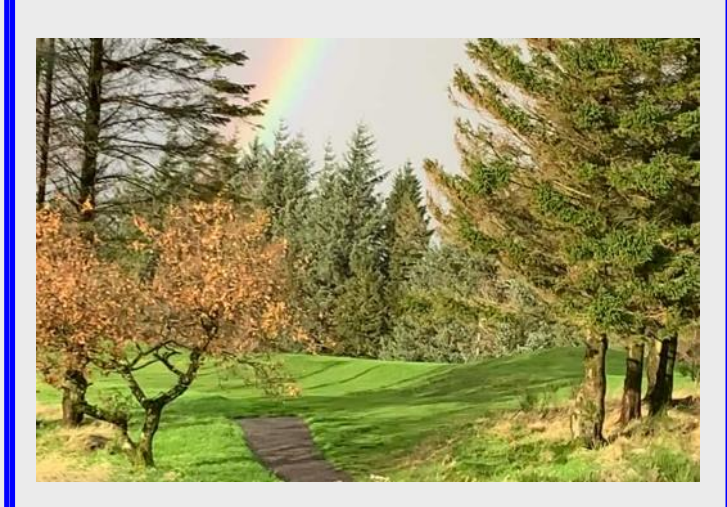
Rainbow over Ranfurly Castle Golf Course

If you would prefer a printed copy of the Service please let your Elder know.