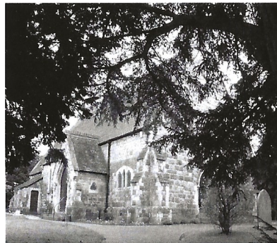
The Parish Church of All Souls, Crockenhill