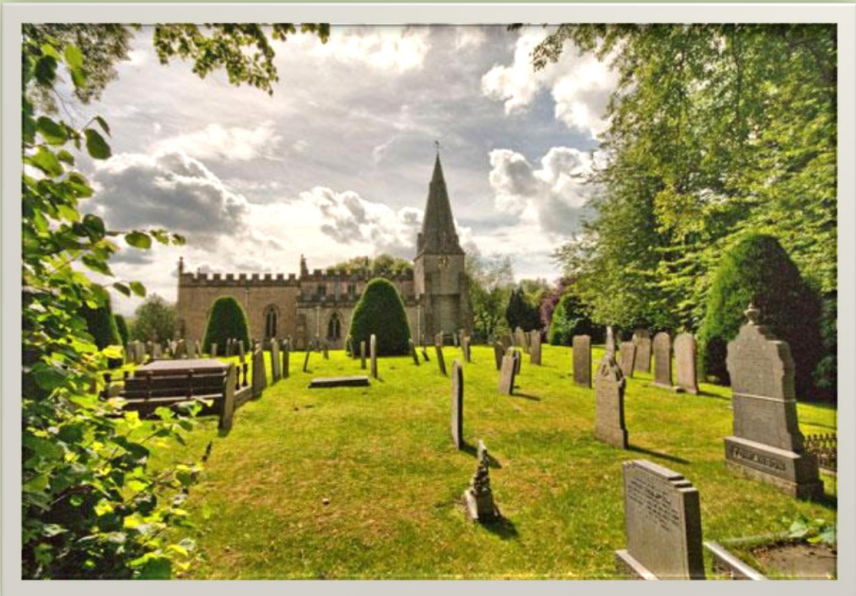
St. Anne's Church, Baslow

'St Anne's is a vibrant worshipping community that is Good News for Baslow – a church that is praying, loving, growing and connecting.'