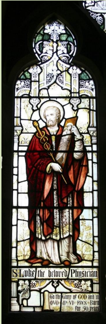
Left: St. Luke the Beloved Physician.

Below is an extract from a letter written to his children on the occasion of Queen Victoria's Golden Jubilee, 1887.