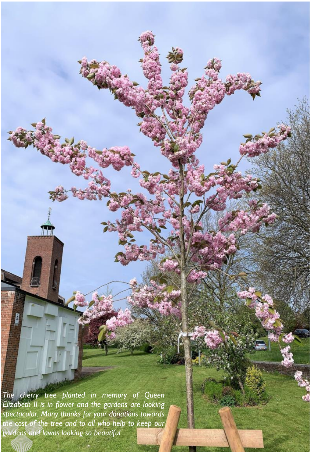
The cherry tree planted in memory of Queen Elizabeth II is in flower and the gardens are looking spectacular. Many thanks for your donations towards the cost of the tree and to all who help to keep our gardens and lawns looking so beautiful.