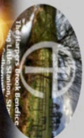
The Harpers' Brook Benefice and Little Stanion, St. Peter's

Now the whole group of those who believed were of one heart and soul, and no one claimed private ownership of any possessions, but everything they owned was held in common. With great power the apostles gave their testimony to the resurrection of the Lord Jesus, and great grace was upon them all. There was not a needy person among them, for as many as owned lands or houses sold them and brought the proceeds of what was sold.