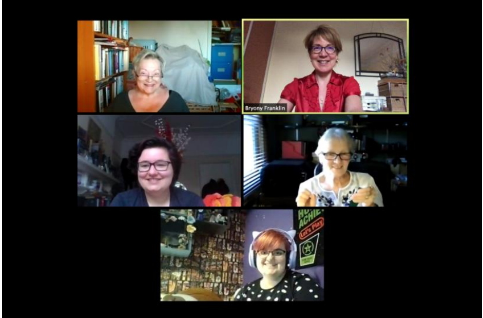
A Zoom chat with the Craft Group during lockdown

As many of you will know during lockdown it was suggested that people might like to make a 'patch' to be incorporated into some sort of commemorative work to be used in church and which recorded the essence of the 'strange times'.