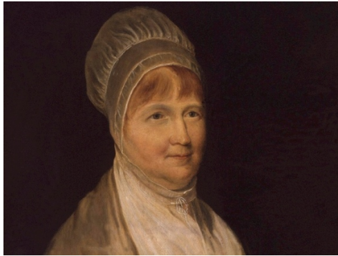
Elizabeth Fry by Charles Robert Leslie