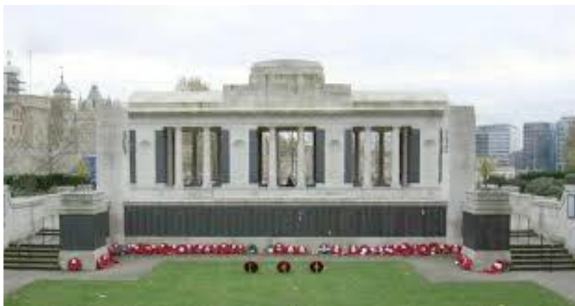
The Merchant Navy War Memorial, Tower Hill, London