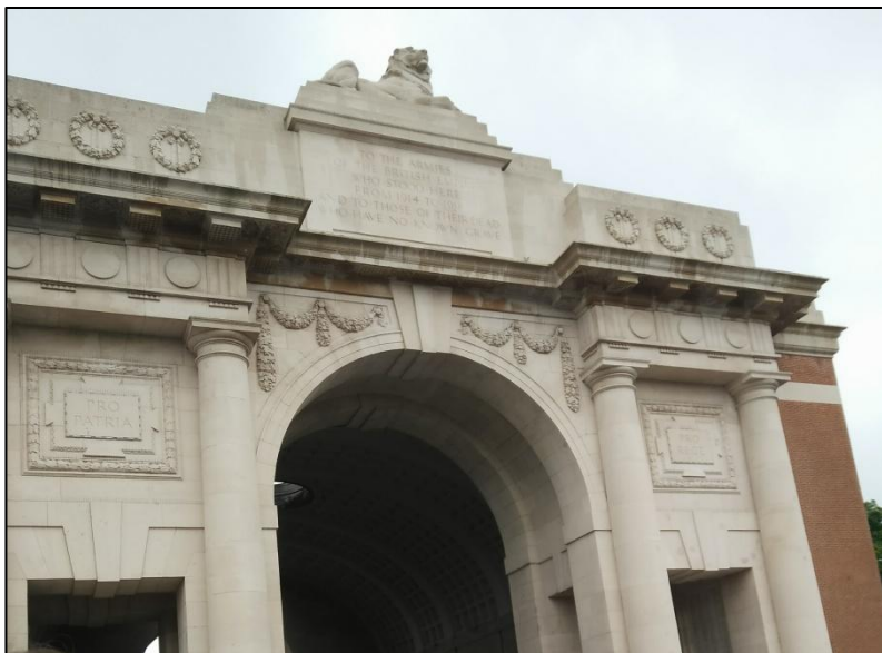
The Ypres Memorial

100 years after their sacrifice: We remember them.