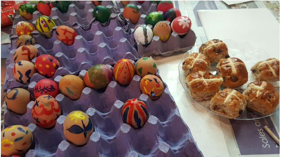
Easter eggs as decorated at Messy Church on Good Friday and hot cross buns.