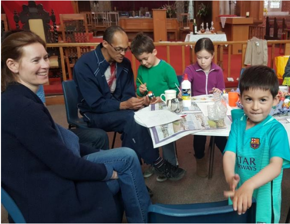
Messy Church in action on Good Friday.