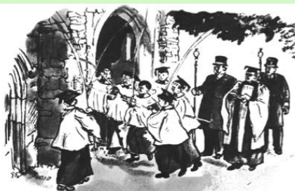
beating the bounds of the parish each year

(FOLLOWED BY MINI MART SALE AT COFFEE FOR CHRISTIAN AID)