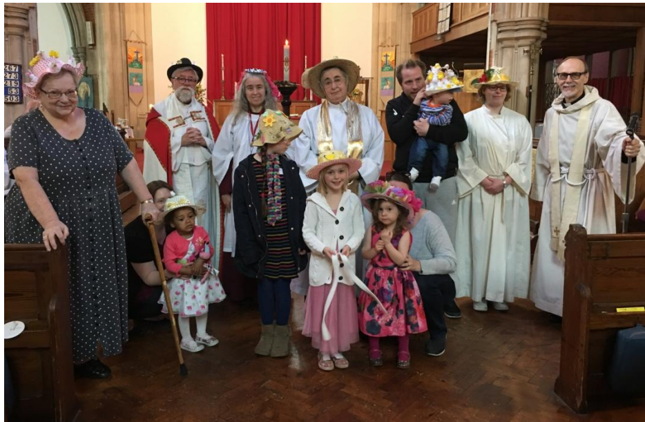
Easter Day Easter bonnet competition entrants.