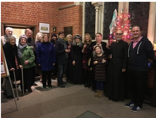
At the Epiphany Carol Service to celebrate the Epiphany and the Feast of the Wise Men – seen here after the service members of the congregation enjoying a glass of port and some cake to mark the occasion.