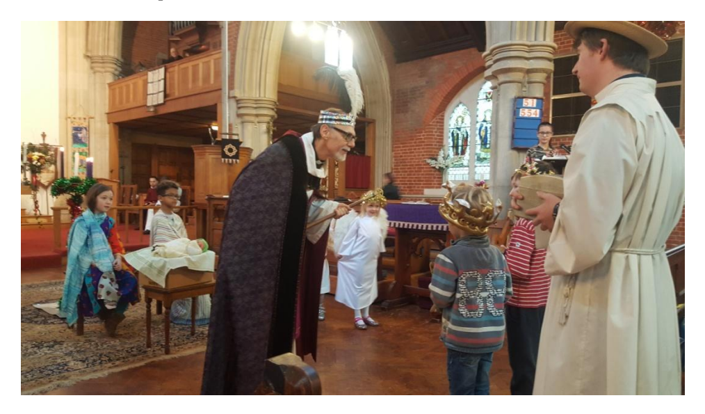
King Herod questions the Wise Men at the Junior Church nativity play