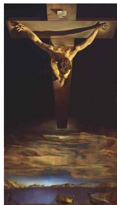
June 14 th Christ of St John of the Cross by Salvador Dali