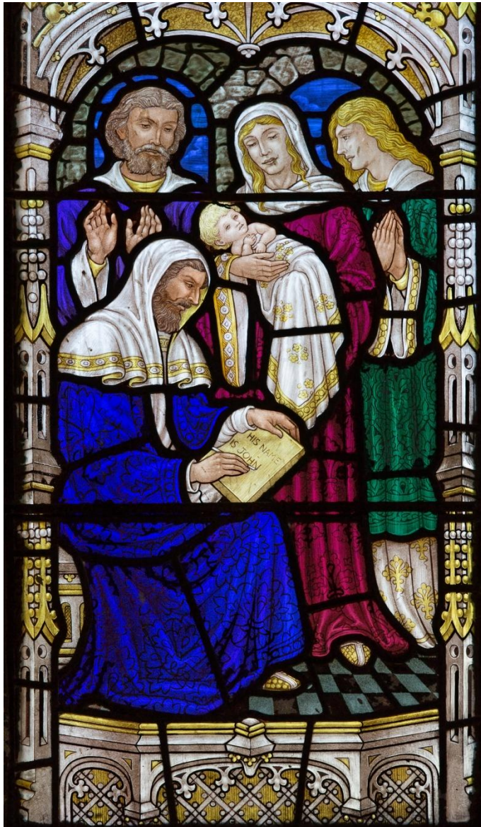
The birth of John the Baptist (June 24th)