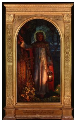
June 7 th The Light of the World by William Holman Hunt

2.00pm Tuesdays in the Parish Room St Martin's West Acton, Hale Gardens W3