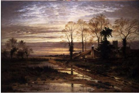
Benjamin Williams Leader 1831 – 1923

This famous Victorian landscape, February Fill Dyke was greeted with lukewarm reviews when it was first exhibited at the Royal Academy in 1881. With later showings in Manchester for the Royal Jubilee Exhibition, it became very popular. The scene is actually a November evening after rain.