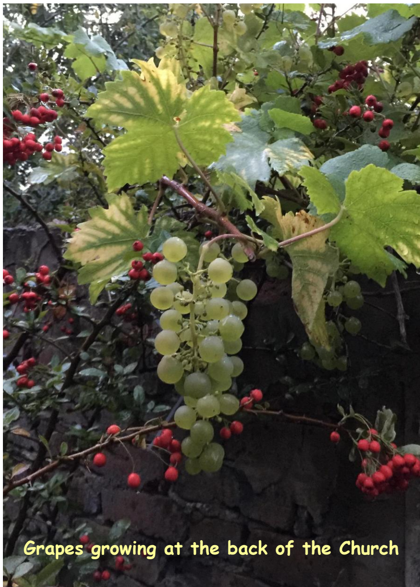
Grapes growing at the back of the Church