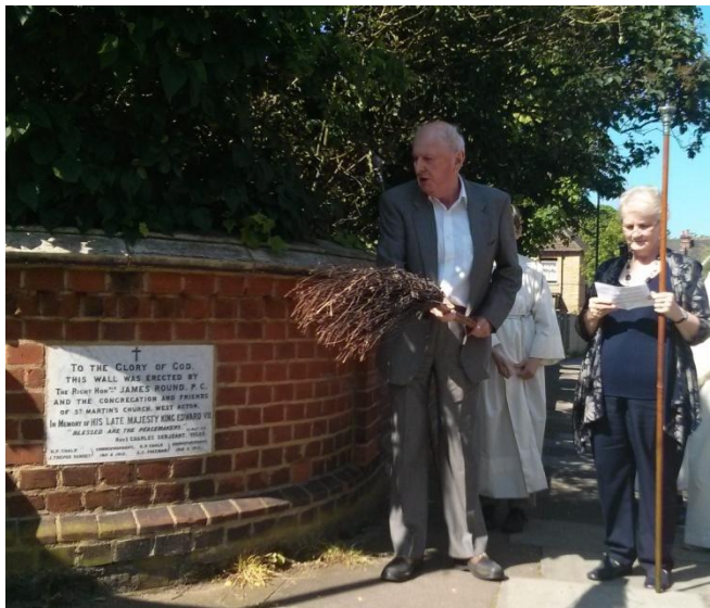
Beating The Bounds