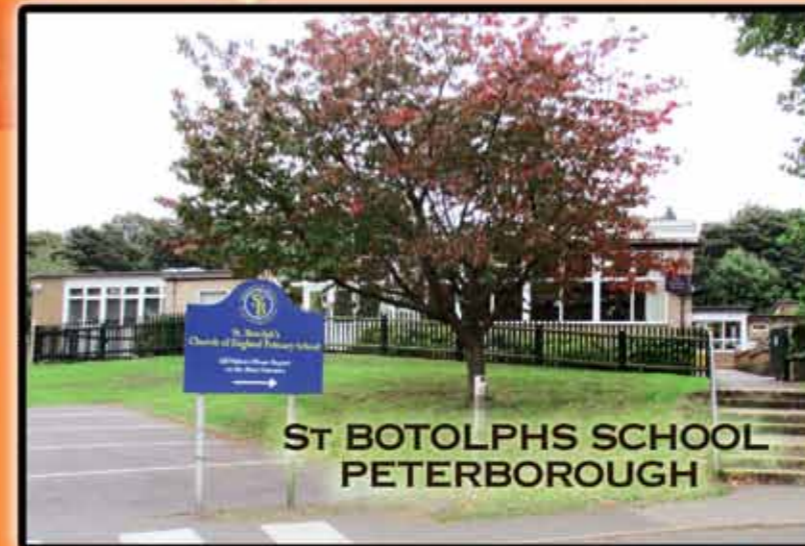
ST BOTOLPHS SCHOOL PETERBOROUGH