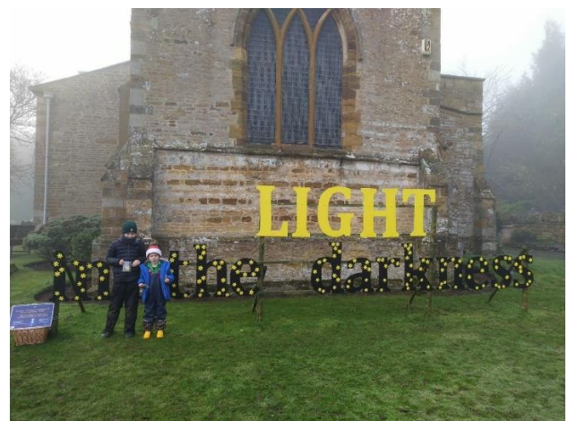
Engaging with a wider community and families through Nativity Trail