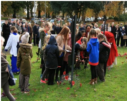
Seasonal Churchyard Art Project (Easter, Summer, Remembrance, Christmas) with activities for children, young people and families.