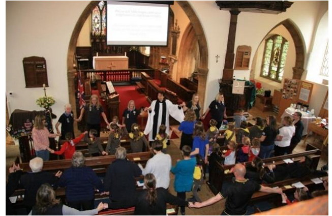
Work with community groups such as local uniformed organisation