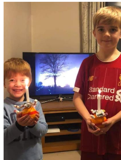
Online Christingle Service

To find more about us, you can see our Youtube channel and Facebook page as well as our website. You can also see us in action during the lockdown in the following links.