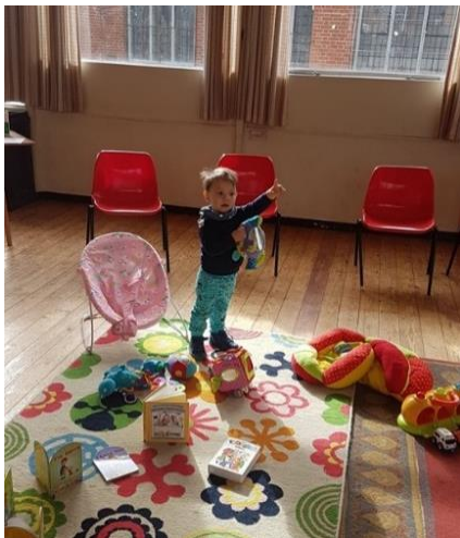
Weekday Toddler's group