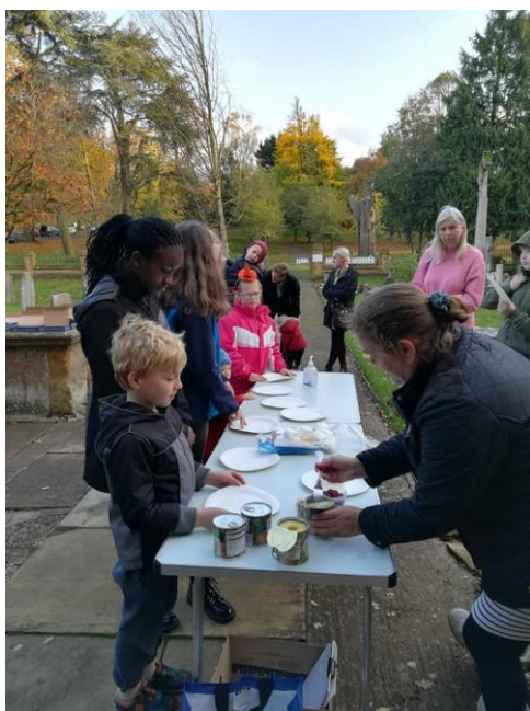
All Hallows Eve activities for families during the pandemic