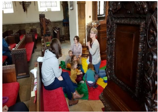
Monthly Sunday Toddler's Church (The Umbrella Church)