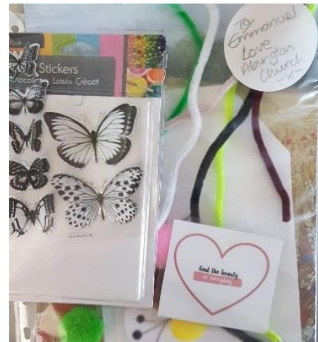
Children's craft packs and gift packs being delivered to local families during the pandemic during the lockdown