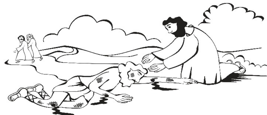
But a Samaritan while travelling came near him; and when he saw him, he was moved with pity. (Luke 10:33)