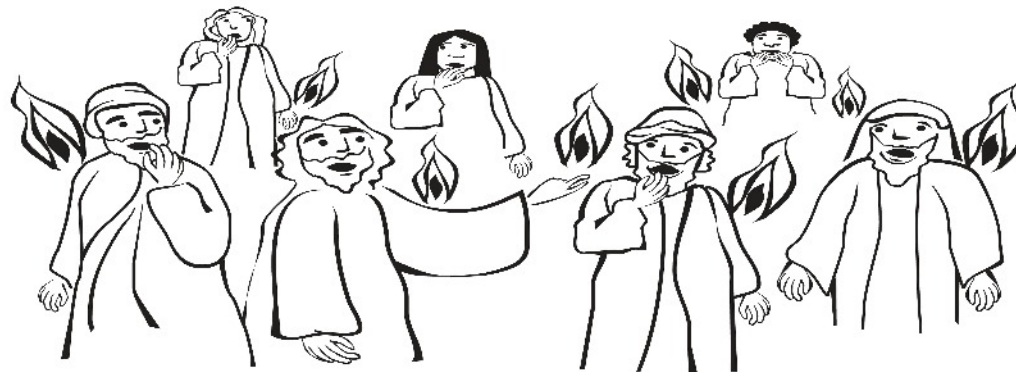
All of them were filled with the Holy Spirit. (Acts 2:4a)