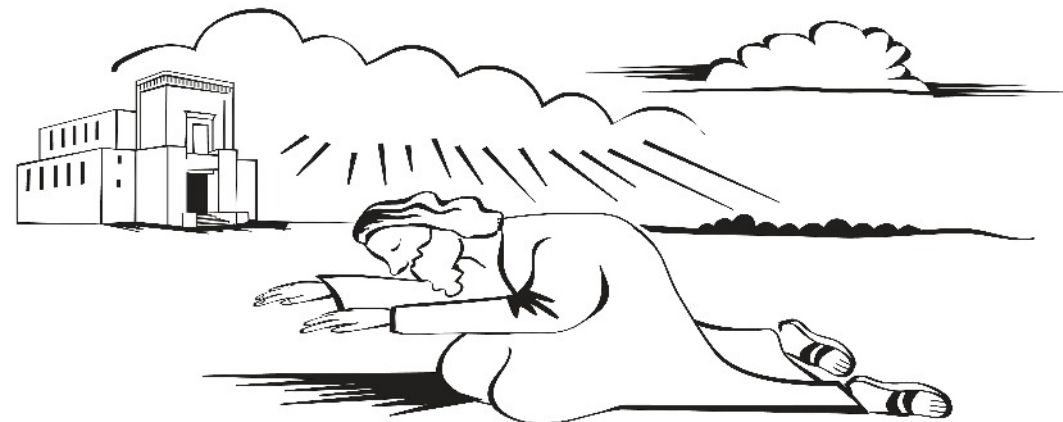
The glory of the Lord filled the temple of the Lord; and I fell upon my face. (Ezekiel 44:4b)

Monday 31 st January 12 noon ~ St Oswald's Prayer Tree