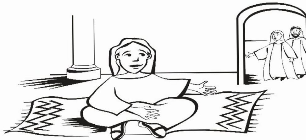
After three days they found him in the temple. (Luke 2:46a)

----- Monday 12 noon ~ St. Oswald's Prayer Tree