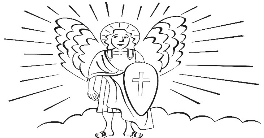
At that time Michael, the great prince, the protector of your people, shall arise. (Daniel 12:1)