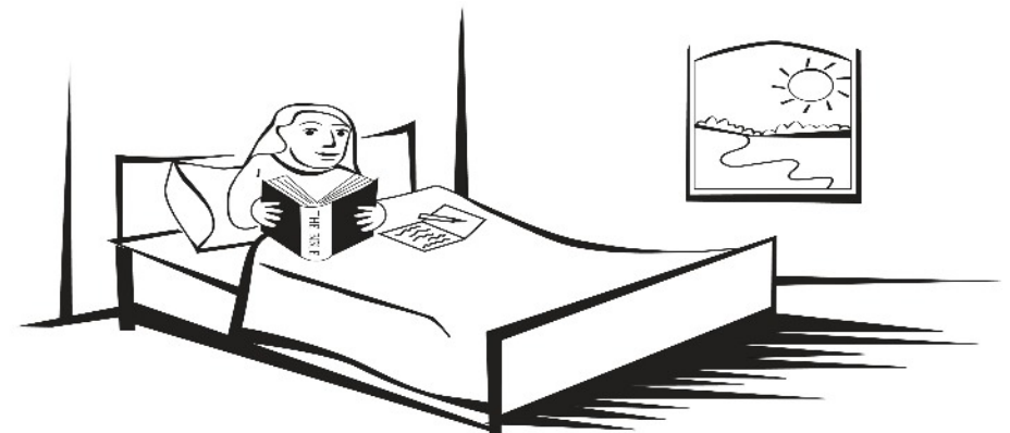
The law of the Lord is perfect, reviving the soul. (Psalm 19:7a)

There will be a Harvest Lunch after the service at St Oswald's.