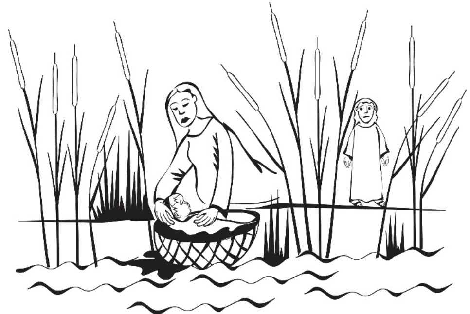
She got a papyrus basket for him . . . she put the child in it and placed it among the reeds on the bank of the river. (Exodus 2:3)