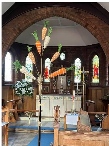
Easter decorations at St Thomas