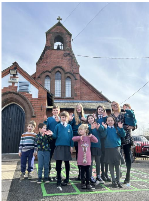
St Paul's School Utkinton- ThankYou