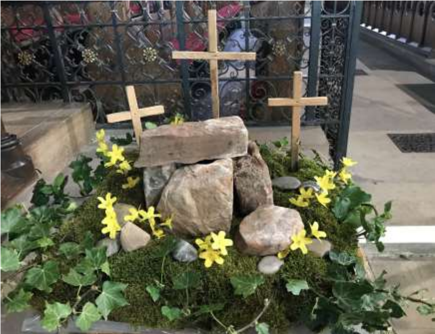
Di Carr's Easter Garden decoration in St Helen's Church