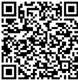
St Oswald's Church

St Oswald's and St Mary's churches are open every day of the week. If you would like to make a donation to the work of St Oswald's or St Mary's, you can do so by scanning the following relevant QR Code below and making a donation: