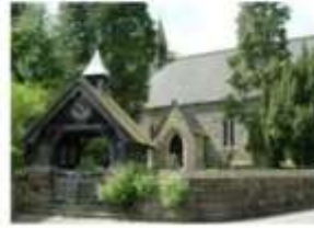
ASHBOURNE GROUP OF CHURCHES