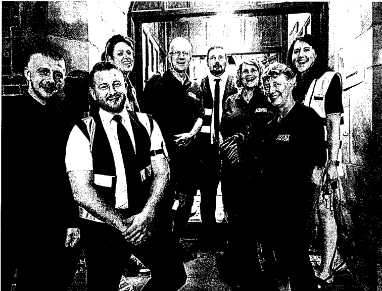
Street Pastors and security staff at the St Mary's co-operative gig in June 2018