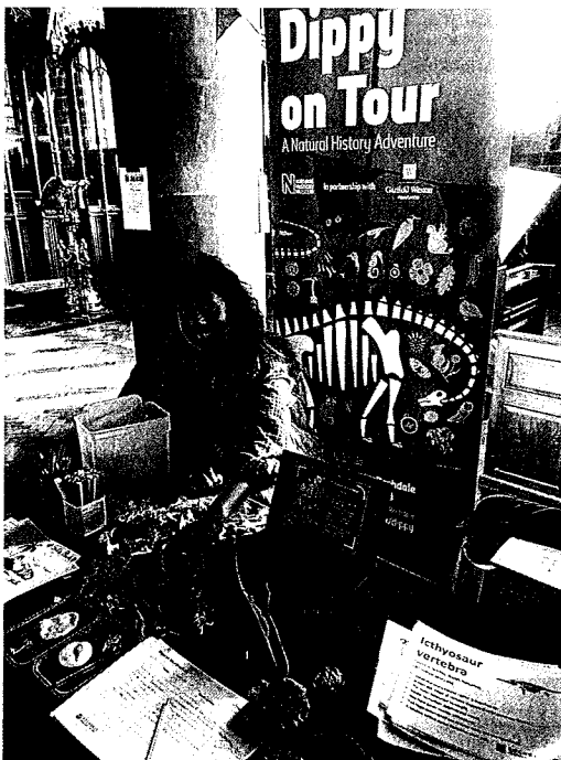
Rochdale Field Naturalists hosted an event at St Mary's "Wild about Rochdale"