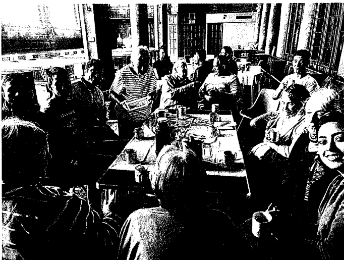
Holy Communion Chatting after the mid week service, After sharing in the Eucharist this simple gathering brings all ages together over a cup of tea