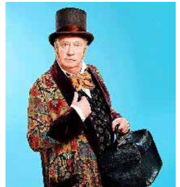
● Mark Williams as Dr Dolittle

Featuring stunning visual puppetry, this new production from the producers of Chitty Chitty