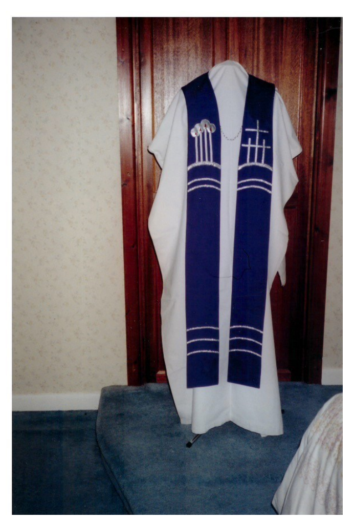
Page 2 09/06/2024