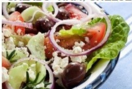
SALADS - HAM, CHEESE