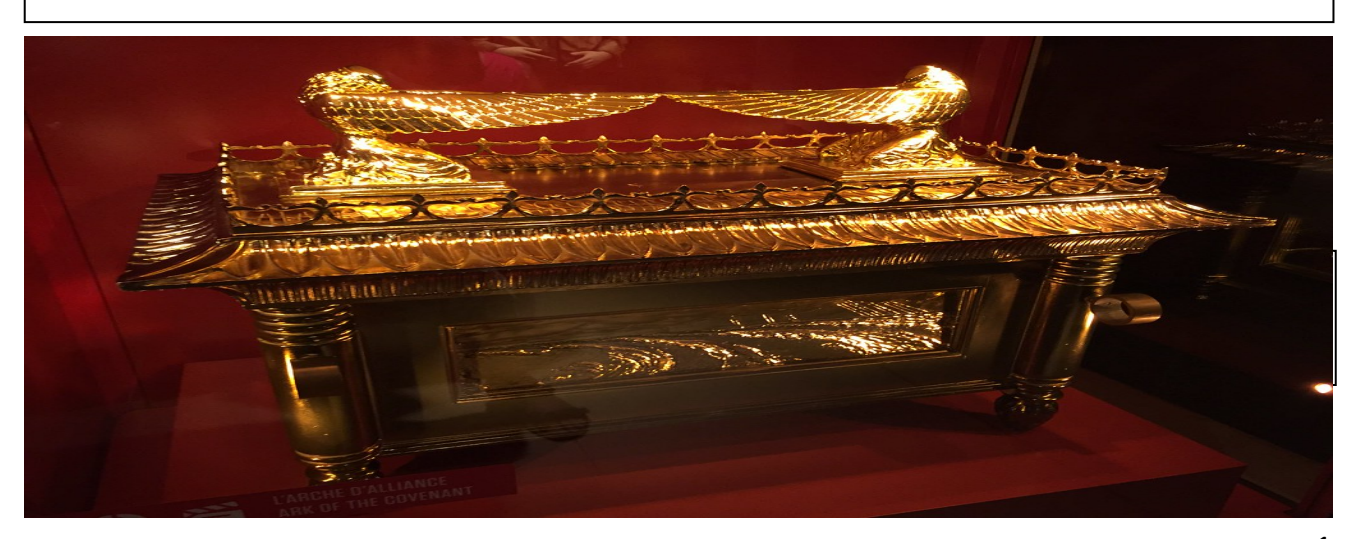
The Throne of Grace - Heb. 4:16; Rev. 11:19; Heb. 8:5; 9:24

We are being prepared for a time of great harvest, a time of great increase and a time of great deliverance. We need to be ready to handle the great opportunity that will come and not 'blow it.' The Old Testament is full of the cycle of blessing, corruption, decline, apostasy, hard times, repentance and restoration. God wants a people who learn to walk with Him humbly and yet powerfully so that He might reveal His love and power to a broken world. What will you do with great increase, great success, and great influence?