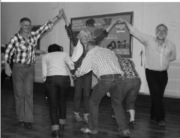
The Friends of St. Mary's recently hosted a barn dance, enjoyed by all who were encouraged to 'swing your partner' and 'do si do!' by the wonderful Whirling Skirmish.