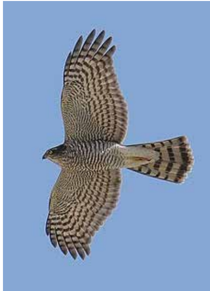
Female bird

Eurasian Sparrowhawk ( Accipiter nisus ) is roughly kestrel-sized, but takes a different approach. Kestrels will hunt from a wood edge into a field, flying up and hovering over a vole before rocketing down. Sparrowhawks ... well the clue's in the name, but they're not limited to sparrows. The wee males cannot manage anything bigger than a mistle thrush, but females have a wider repertoire. I once stood at the woodland edge in the hills above Henley and saw a sparrowhawk pluck a red-legged partridge. When you see lots of woodpigeon feathers on the path in Green Wood,