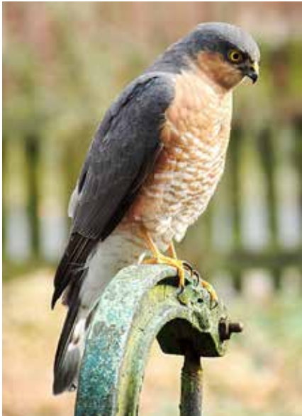
Male bird

Recently a friend told me 'I've seen an exciting bird ... you'll know what it was'. 'Bet I won't', I thought. But as soon as she described the 'biggish stripey bird' chasing a smaller bird through her garden, I said 'Female sparrowhawk ... near enough guaranteed.' A hunting sparrowhawk is like the speeder bikes on Endor in Return of the Jedi —it follows its prey at blistering speed through the gaps between trees, and right through beech hedges. The female is brown-backed, with horizontal brown bars on a white breast; the smaller male has a slaty back and rusty bars; both have striking yellow eyes.