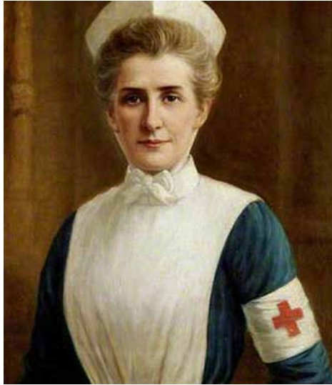
Photo: Edith Cavell

Whilst a significant amount has been unearthed as regards the male role in clandestine Intelligence operations, much less has been imparted as to the role women played in this sphere of work.