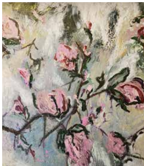
Magnolias by Nicola Weavers