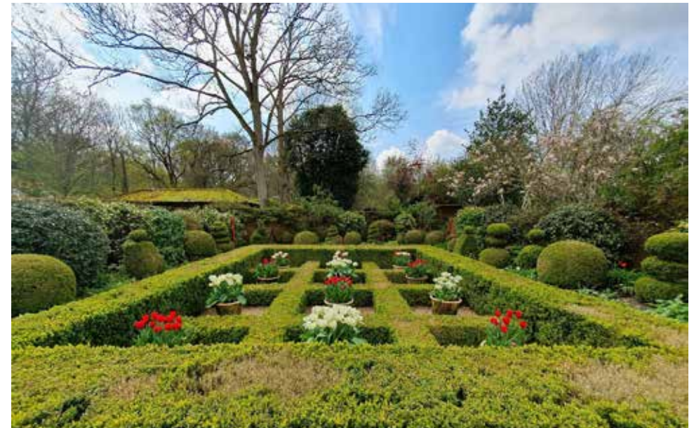
West Green House garden