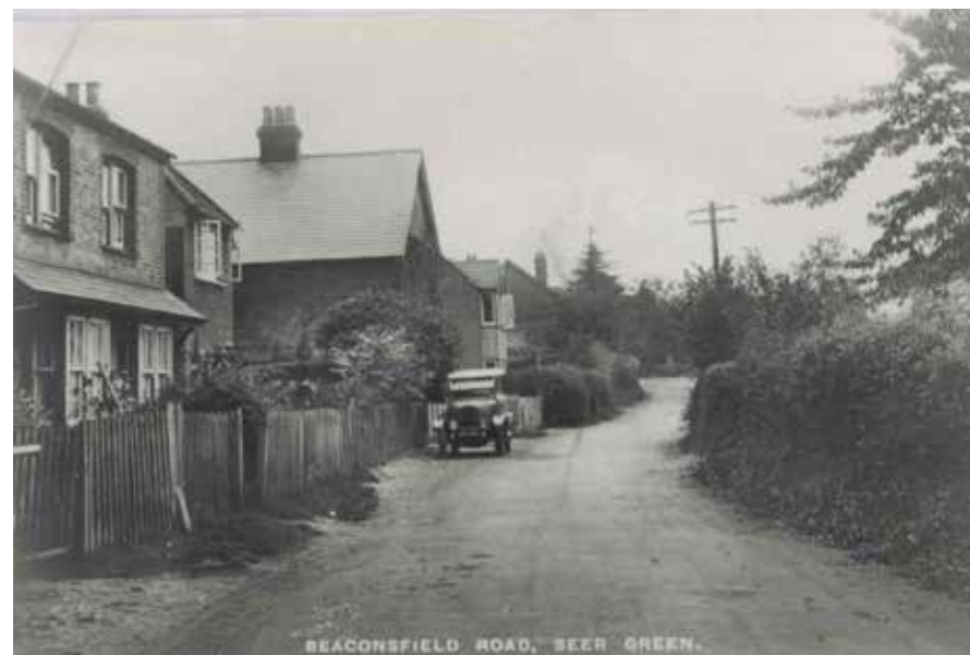
Photo: Beaconsfield Road now Orchard Road