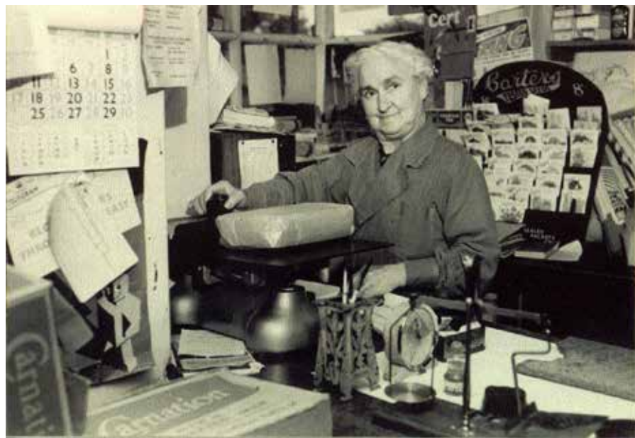
Inside the Old Post Office