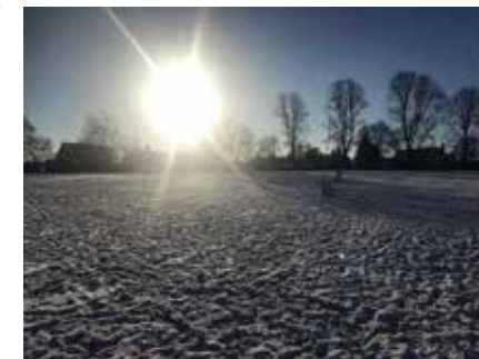
Two more pictures of the green in Jordans, this time with snow