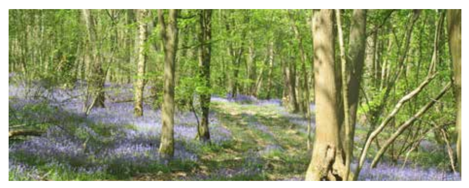
Bluebells in Blue Cross Wood