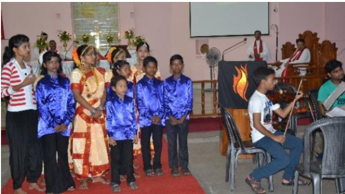
The children singing a special song