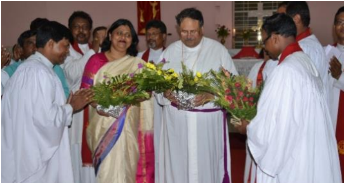
The priests welcoming them back