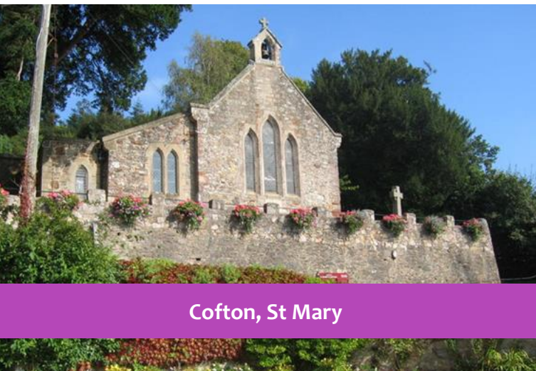
Cofton, St Mary