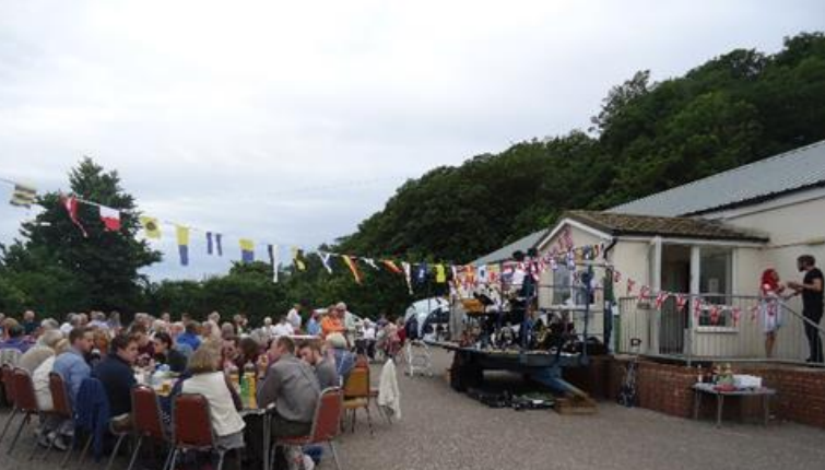
Celebrating with the community at St Mary's Hall