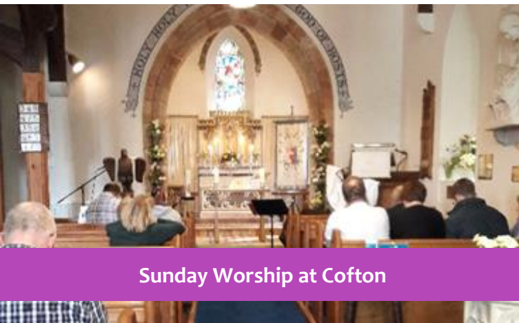
Sunday Worship at Cofton