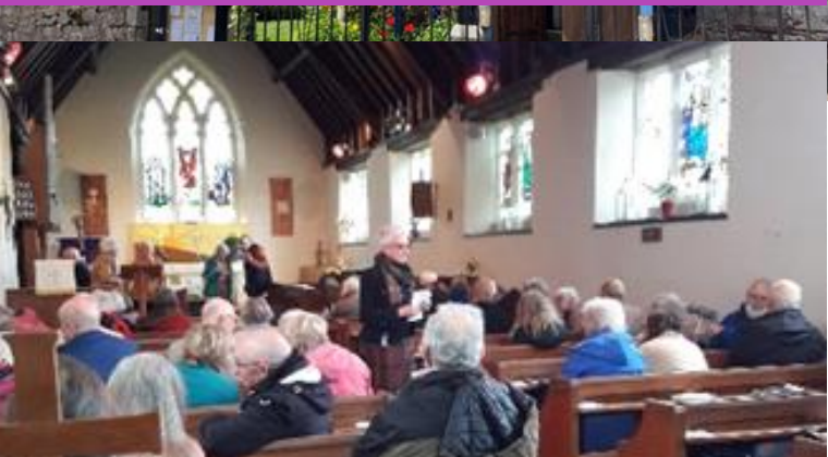
Worship at St Gregory's