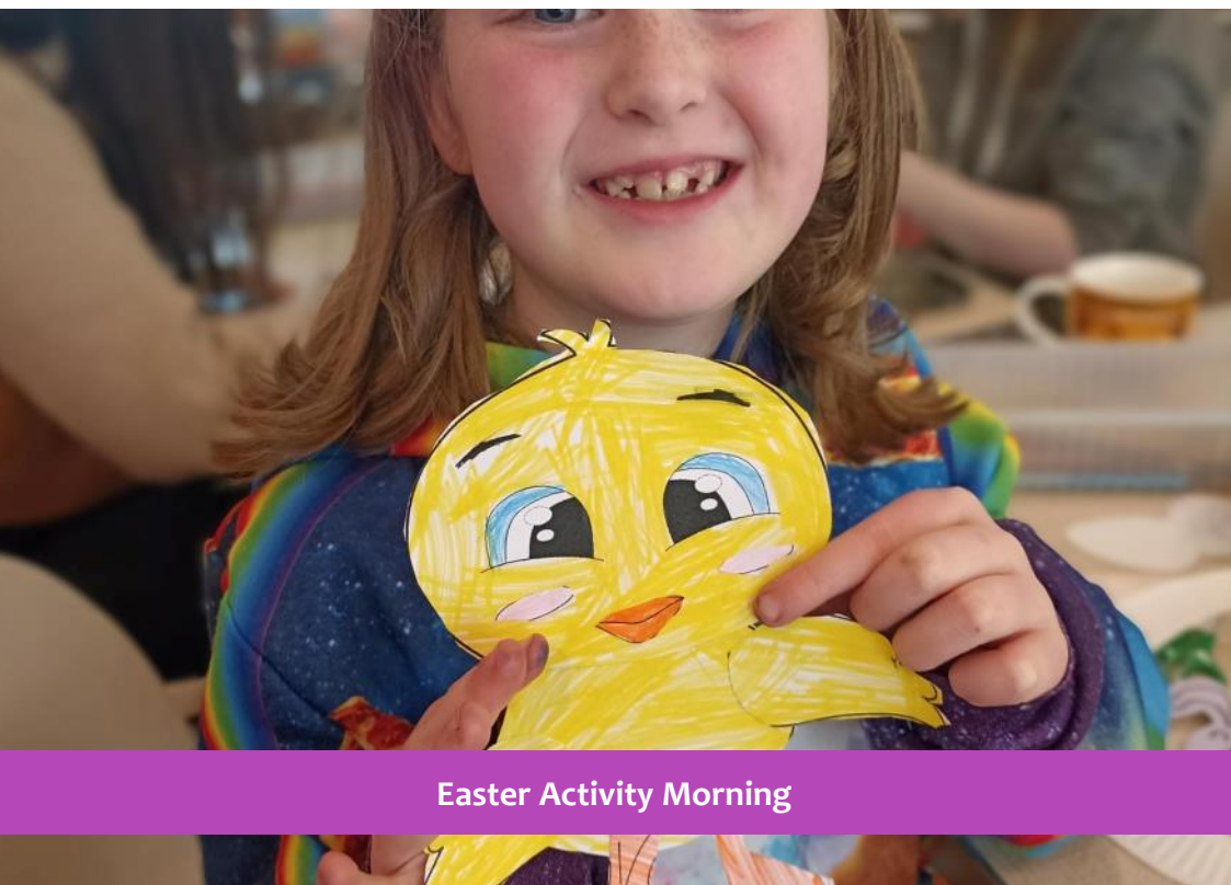
Easter Activity Morning