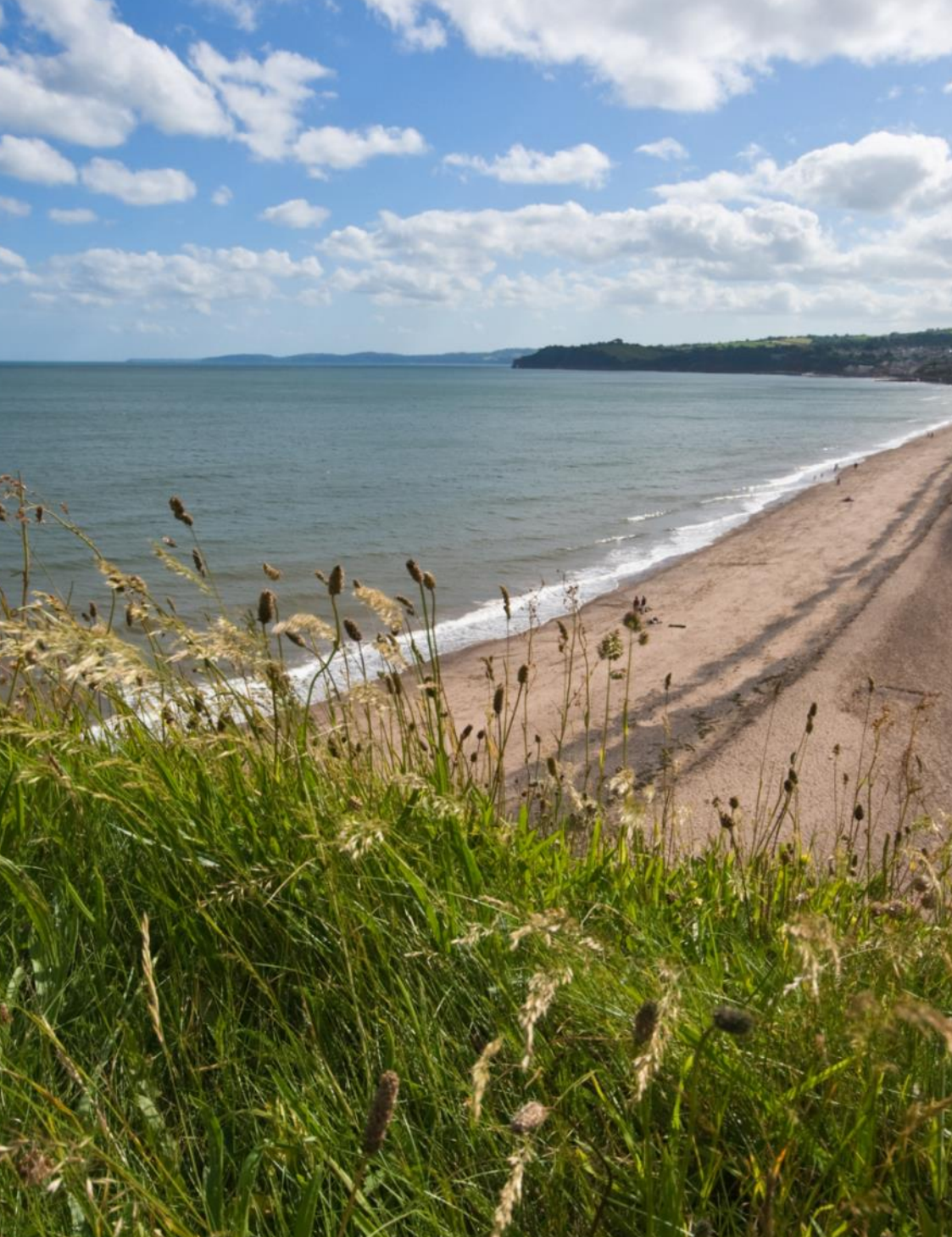
The Dawlish Coastline