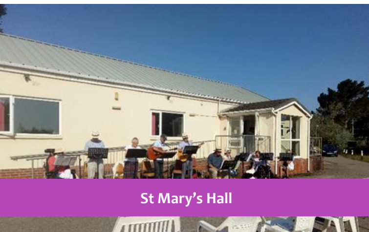
St Mary's Hall