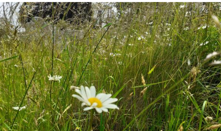
Our Wonderful Community