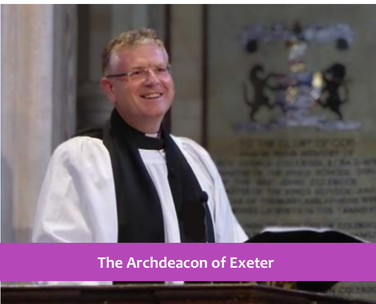
The Archdeacon of Exeter