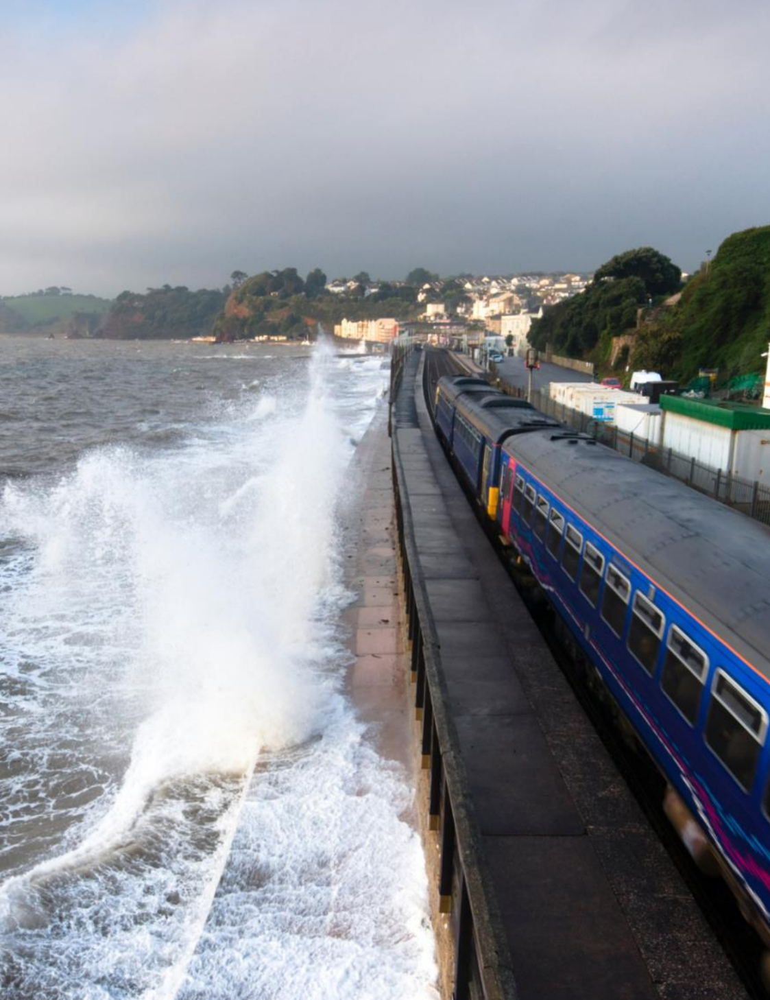
The South West Main Line through Dawlish