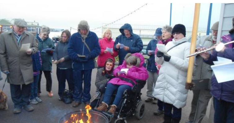
Keeping warm at the Easter Morning Service