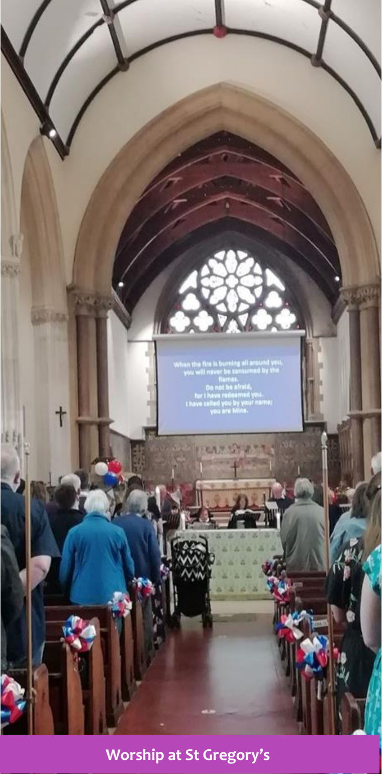
Worship at St Gregory's