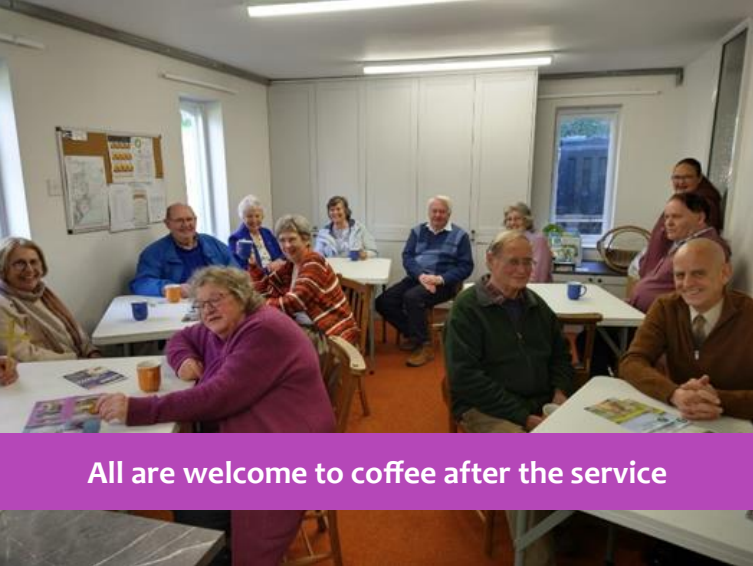
All are welcome to coffee after the service