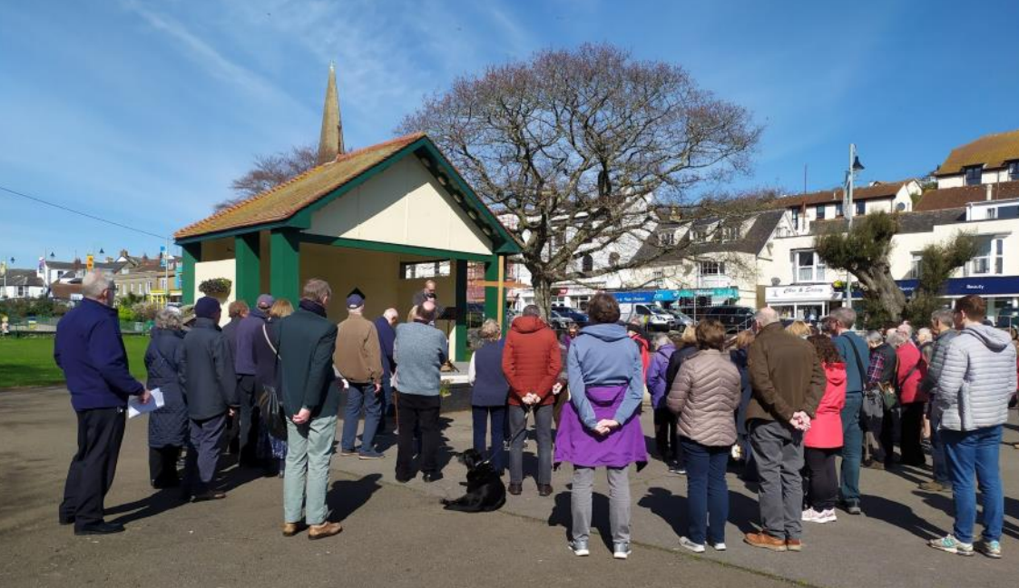
Good Friday Walk of Witness