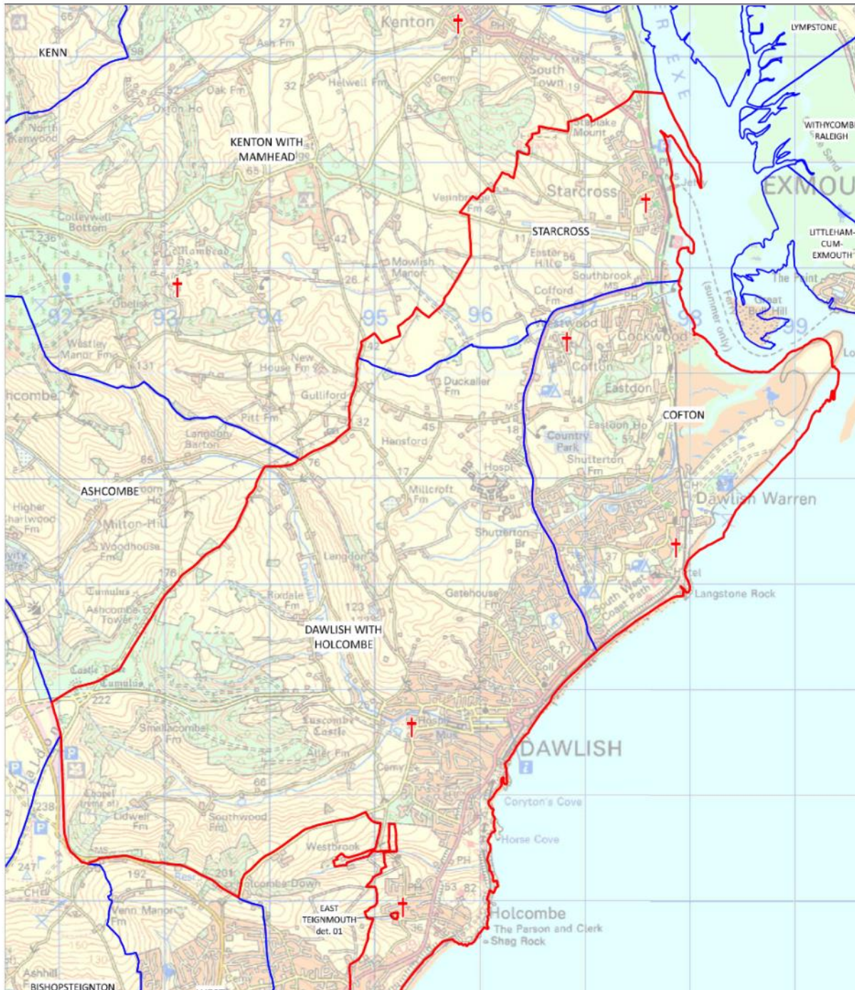
The Mission Community Map