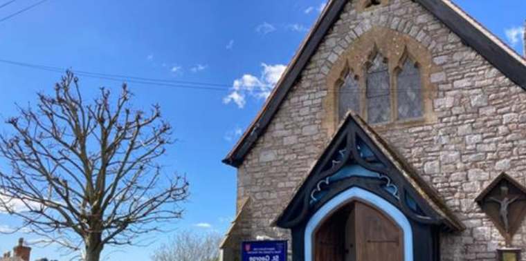
Welcome to Holcombe, St George