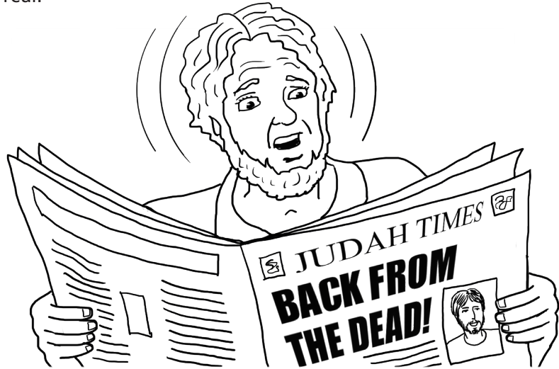
Thomas needs to meet Jesus to believe.

Jesus has risen from the dead and appeared to the disciples, but Thomas, who wasn't there, needs to see and touch Jesus in order to believe that he's real.