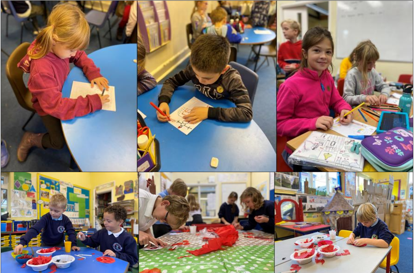
Children from Coberley C of E Primary School making Christmas cards to be given to patients in hospital on Christmas morning along with a gift.

The Parish Magazine for the Benefice of Bagendon, Baunton, Coberley and Cowley, Colesbourne, Elkstone, North Cerney, Rendcomb and Stratton