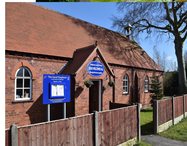
THE GOOD SHEPHERD