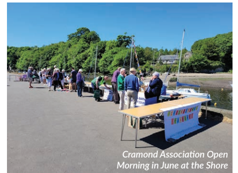
Cramond Association Open Morning in June at the Shore

The foreshore event in June was successful so we hope to repeat it next year and look at other activities around Christmas.