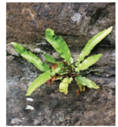
Hart's tongue Fern

Above the weir Charlock and Russian Comfrey were flowering and attracting bees.