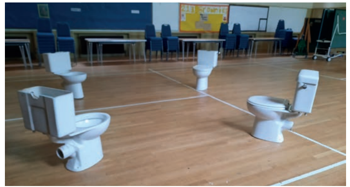
The ladies toilets practise social distancing before leaving for their new homes.