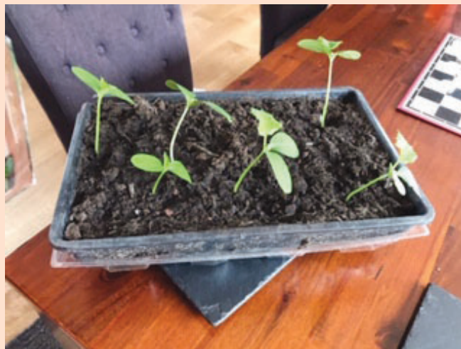
Cucumbers grown by Esme.

to do at home, including their 'grow your own' badge. We are continuing over the summer period - providing a fun programme for those girls who are happy to take part in virtual meetings. We have learned how to make a cake in a mug, we are going to be making armpit fudge