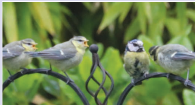
Finally, feeding time for this family of blue tits was fun to watch.