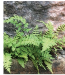
Brittle bladder Fern