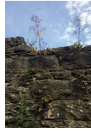
Wall Lettuce, Hawkweed and Rose- bay Willowherb

Having seen some rather attractive flowers around Fair-a-Far in the past, in late June I decided to have a look at what was growing and hoped they were still there. Firstly, I looked for Valerian and Monkeyflower. Common Valerian, a native species, had been present near the top of the weir in 2016. It wasn't there anymore but it was good to see it now growing on the wall by the river bank. In 2014 Monkeyflower had been growing on this wall and thankfully was still clinging on. Great! It was introduced from W N America and has become naturalised in the UK and likes to grow in damp areas often by streams and rivers.