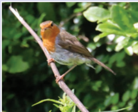
Everybody loves a robin

As a keen, amateur photographer, who loves taking photos of wildlife, 'Lockdown' sounded like a nightmare. At this time of year, there would be no trips to the Isle of May to enjoy the puffins, guillemots, razorbills and more; no visits to Argaty to marvel at the aerial agility of the red kites or enjoy watching the red squirrels from the woodland hide.....what would I do?